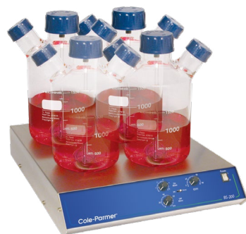
BS-200-4-1000 4 Position Biological Stirrer