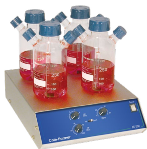
BS-200-4-500 4 Position Biological Stirrer