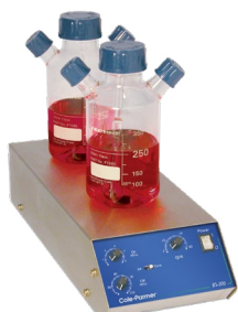
BS-200-2 2 Position Biological Stirrer