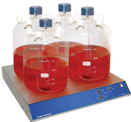
BS-200-4-5000 4 Position Biological Stirrer