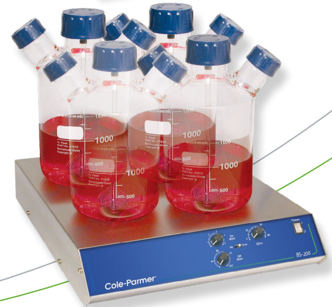
BS-200-4-5000 4 Position Biological Stirrer