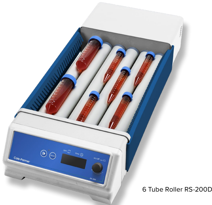
6 Tube Roller RS-200D

The roller tubes on Cole-Parmer® roller mixers conveniently detach to accommodate larger vessels and therefore allow the user to mix a wide variety of differently sized tubes and bottles. Cole-Parmer® roller mixers provide the highest levels of versatility as any of the roller tubes can be removed meaning the user can choose the arrangement depending on their needs.